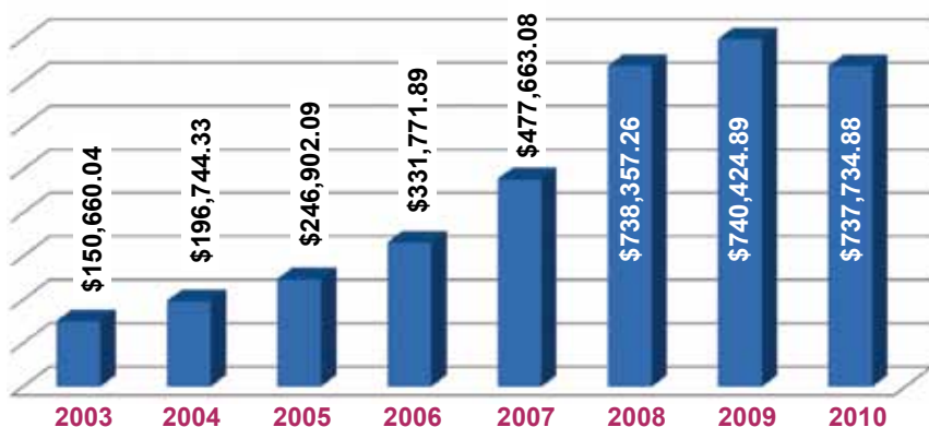
End of Year Total Assets

In the years ahead, the foundation's challenge is to build on its initial success and expand financial support provided to the programs for Pasadena ISD students.